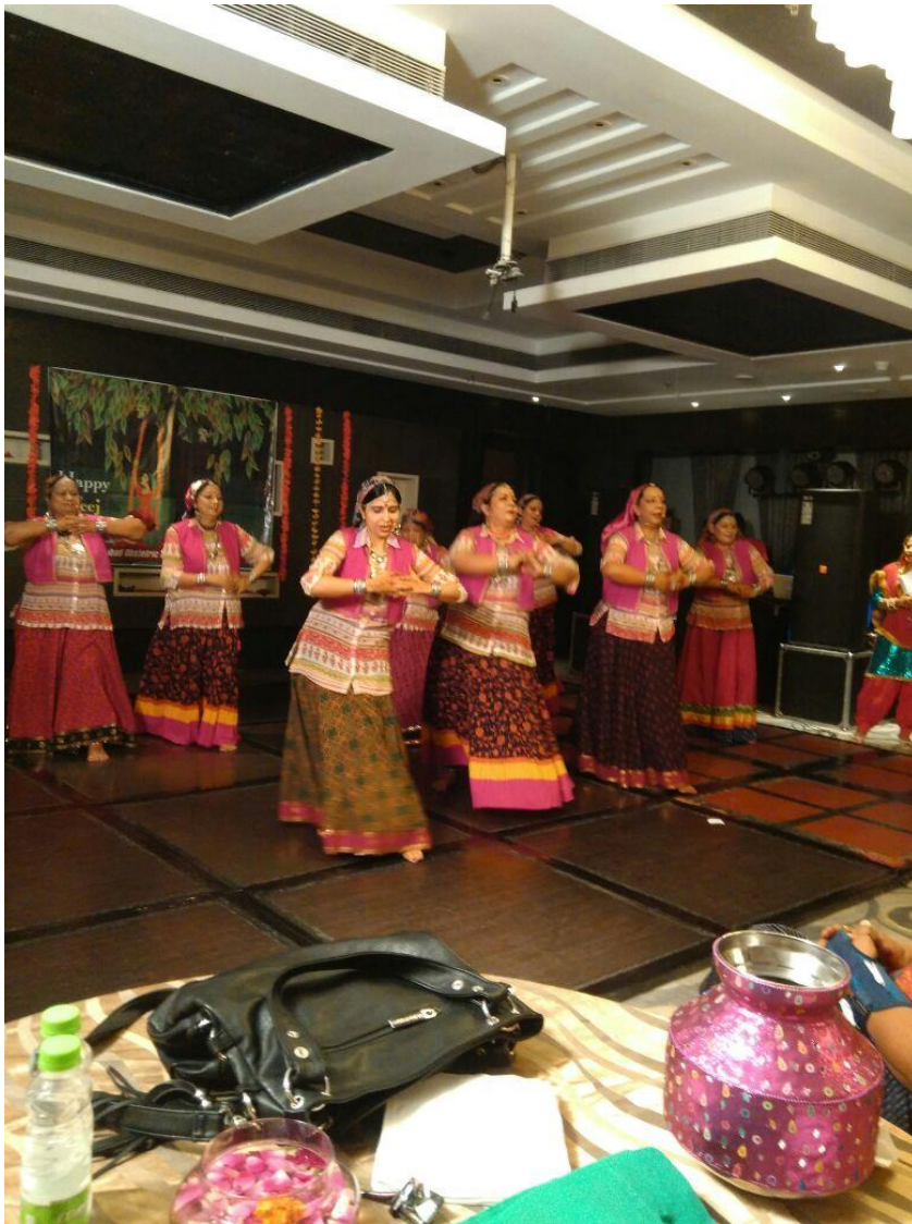
Pahadi Folk Dance