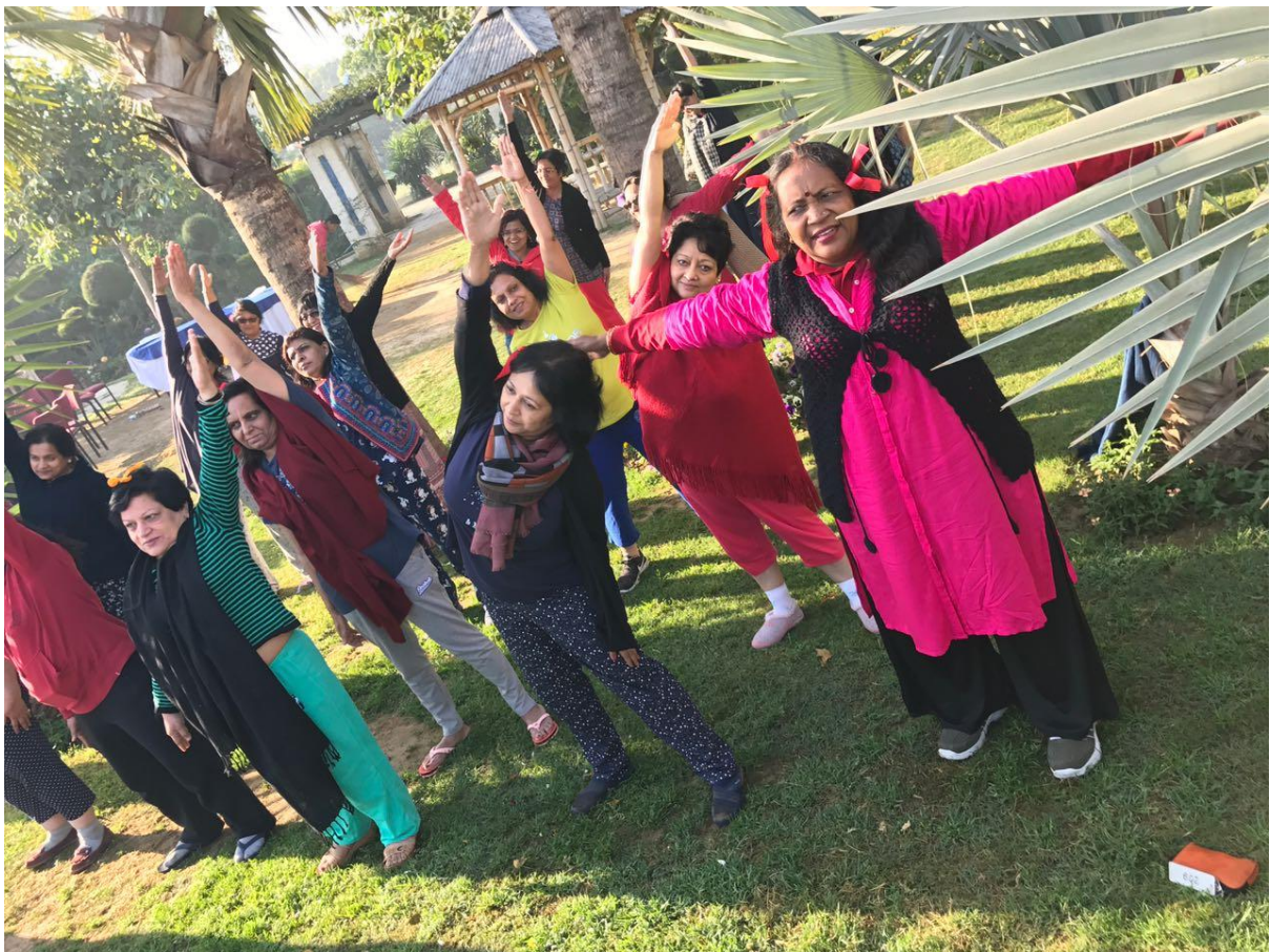
Yoga Lesson at Outdoor CME