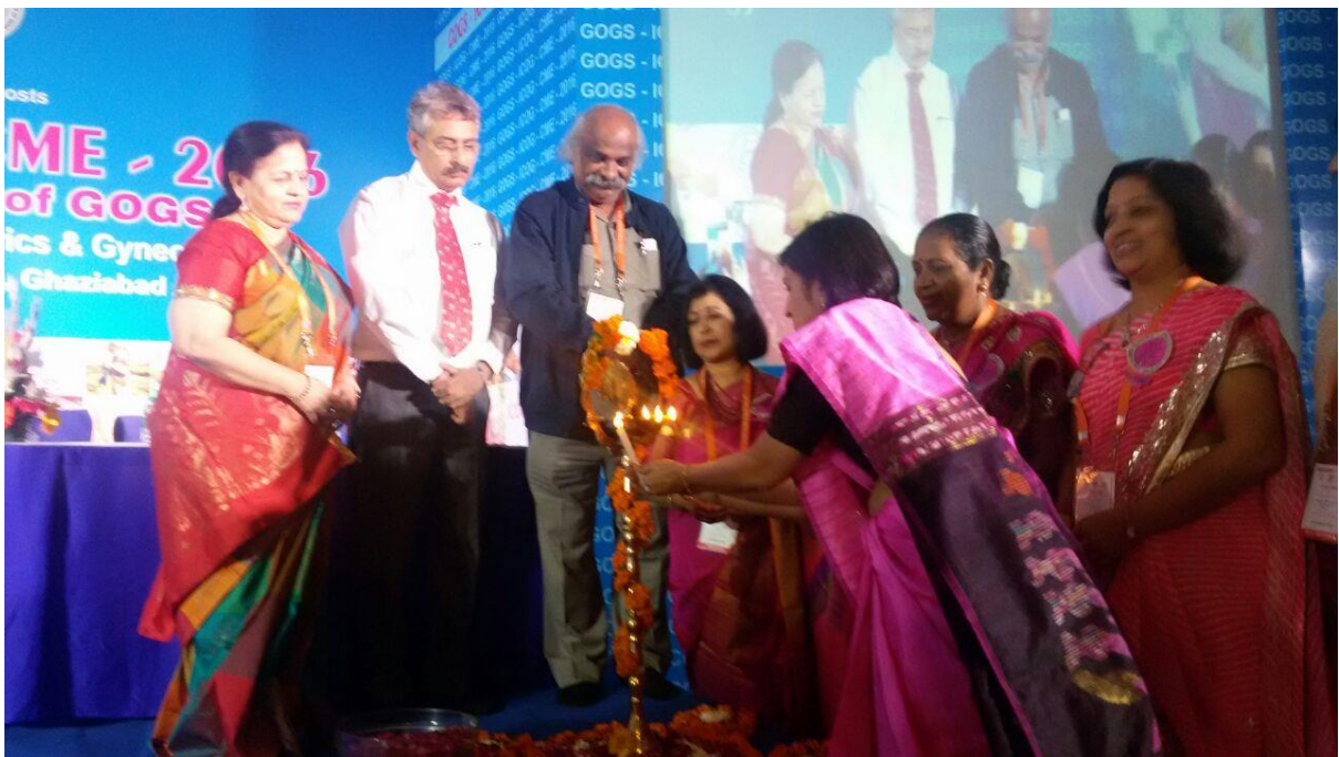
Inauguration of Annual CME