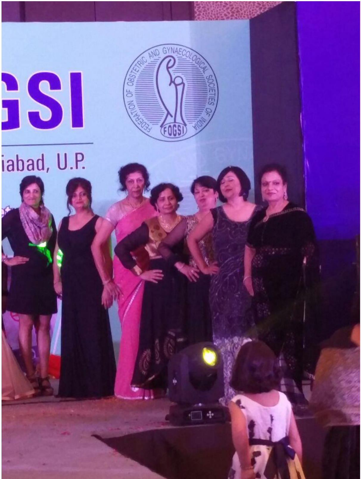
Ramp Walk at NZY