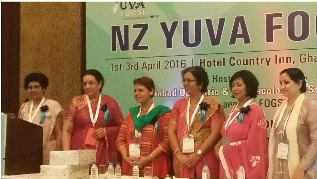
National-level conference NZY