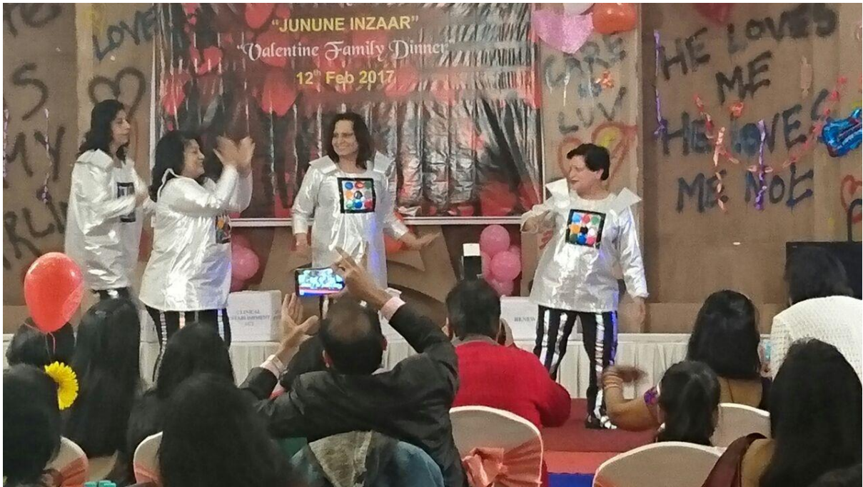
Gynaecologists as robots