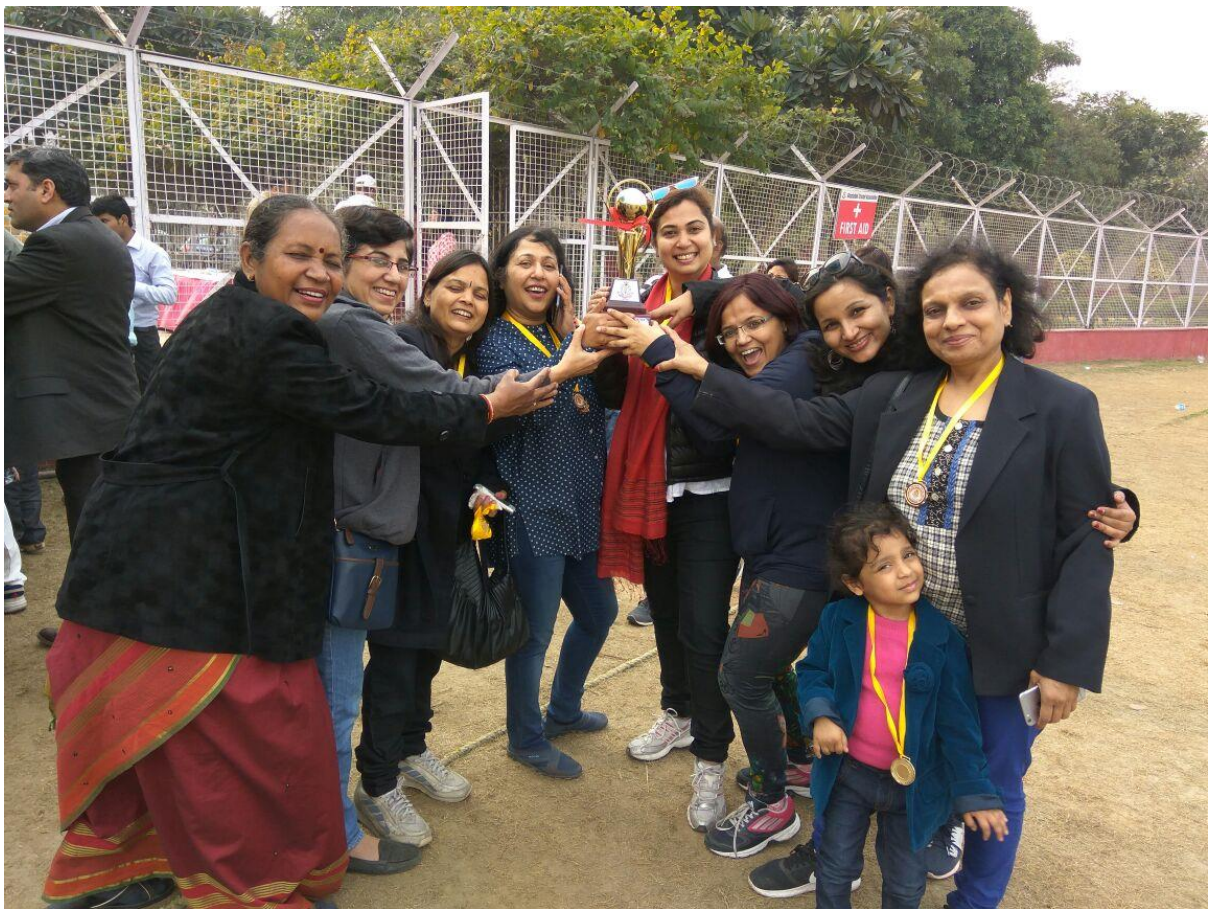
IMA Sports Day