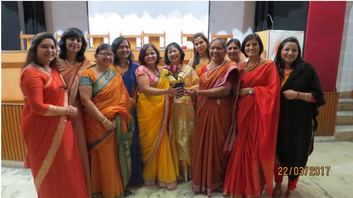
aHanding over responsibilities to the new team