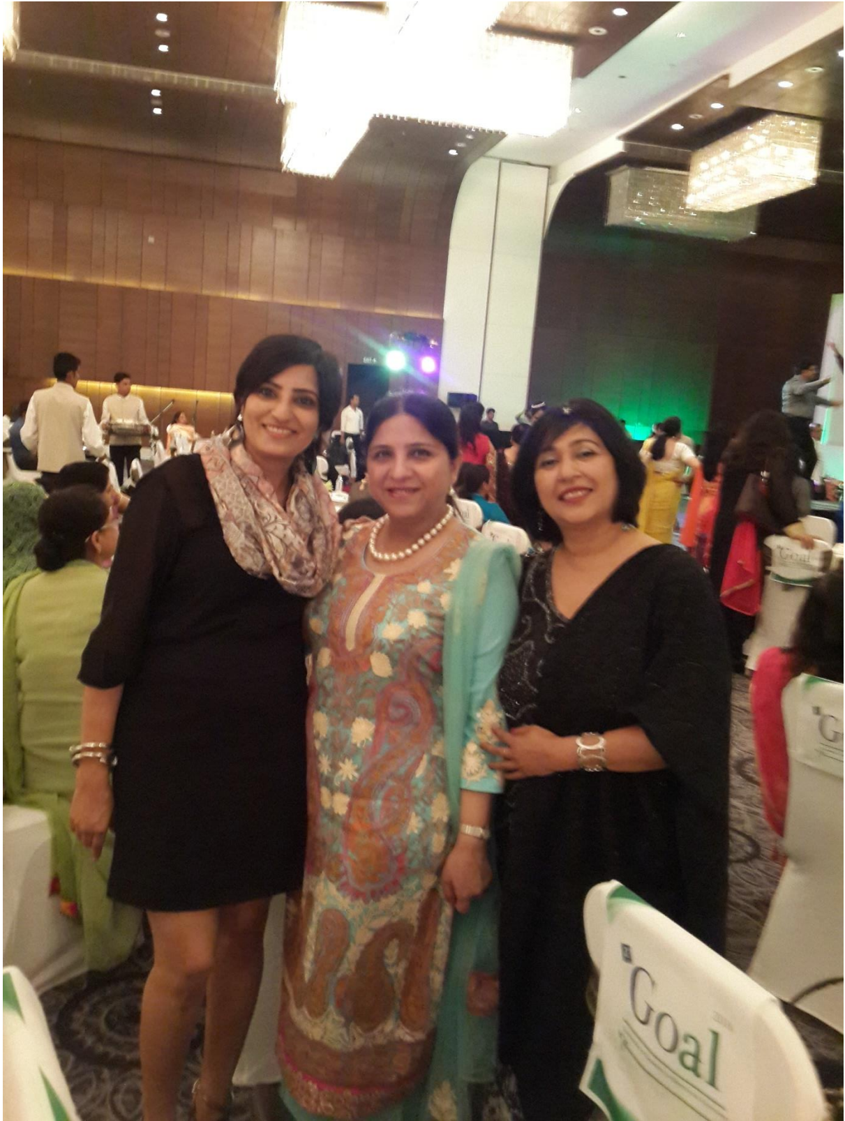
At GOAL Conference, New Delhi