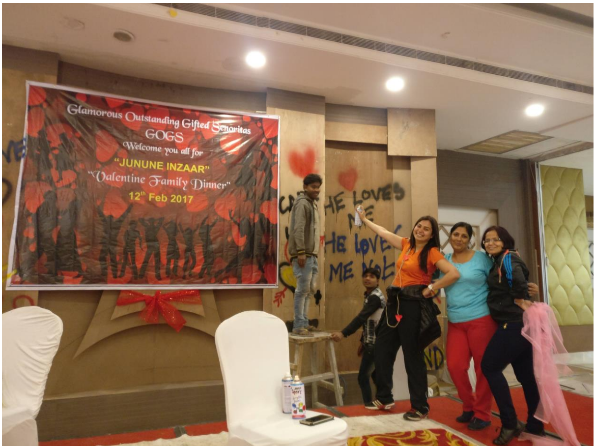
Hall Decoration, Family Dinner - Annual CME