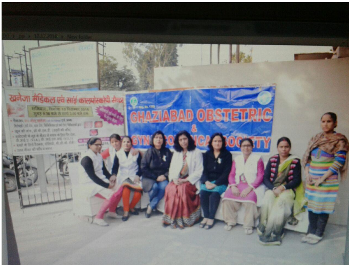
Camp in association with ISCCP