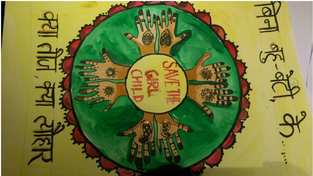
Winner Exhibit, Rangoli Competition