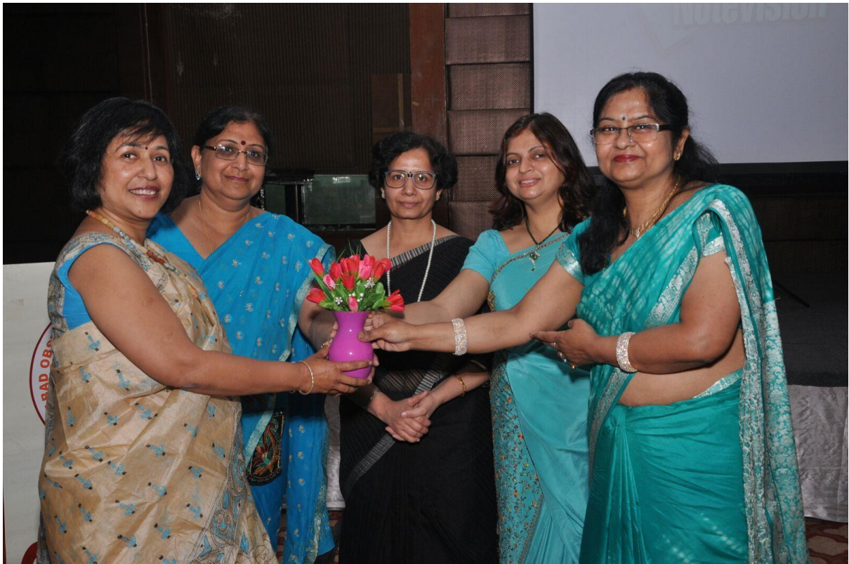
Taking office for the 2016-17 year