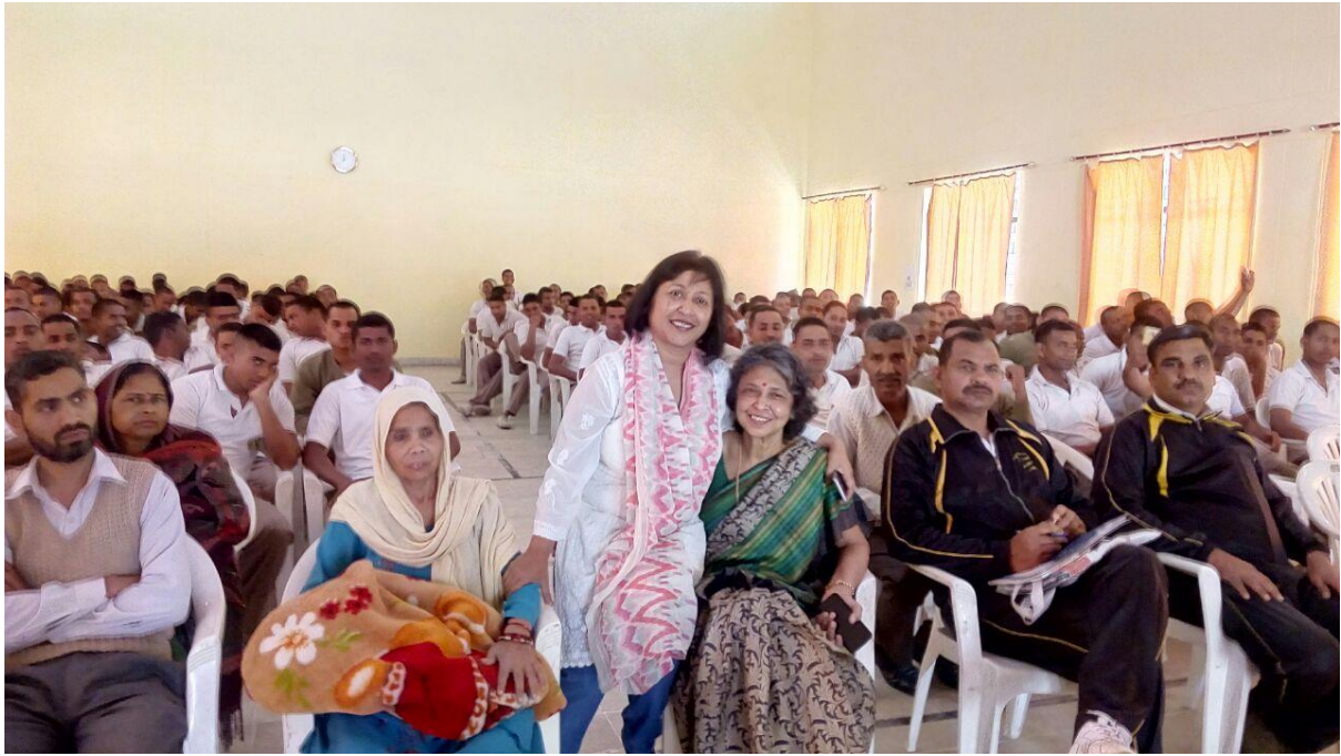
Cancer Awareness Camp at PAC