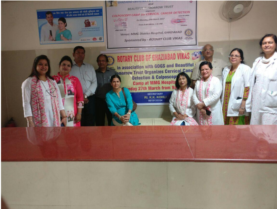
Camp in association with Rotary Club (Ghaziabad Vikas)