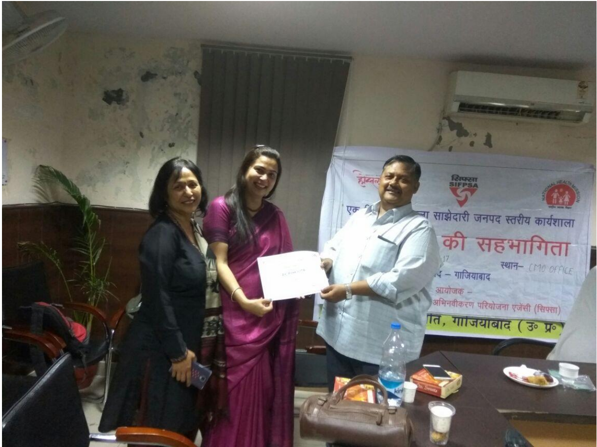
Recognition for doing maximum ligations at Hausla Sajhedaari programme of PSI