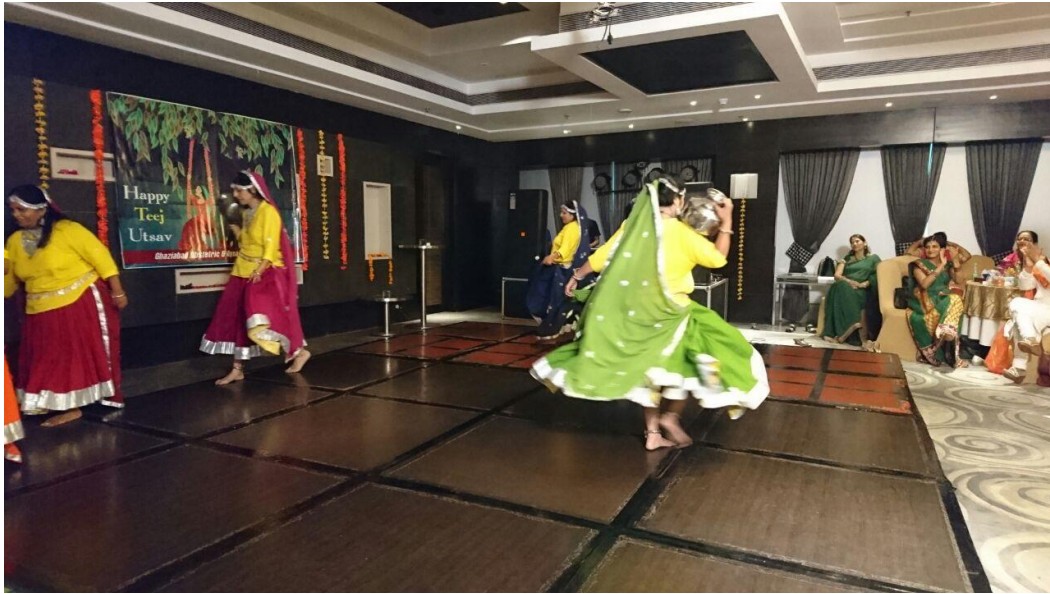
Haryanvi Folk Dance