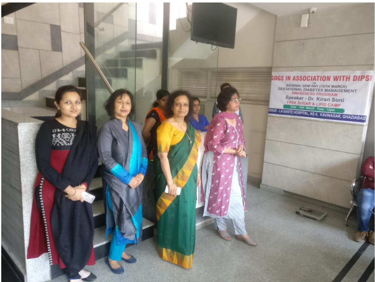
Diabetes Awareness Camp at PAC