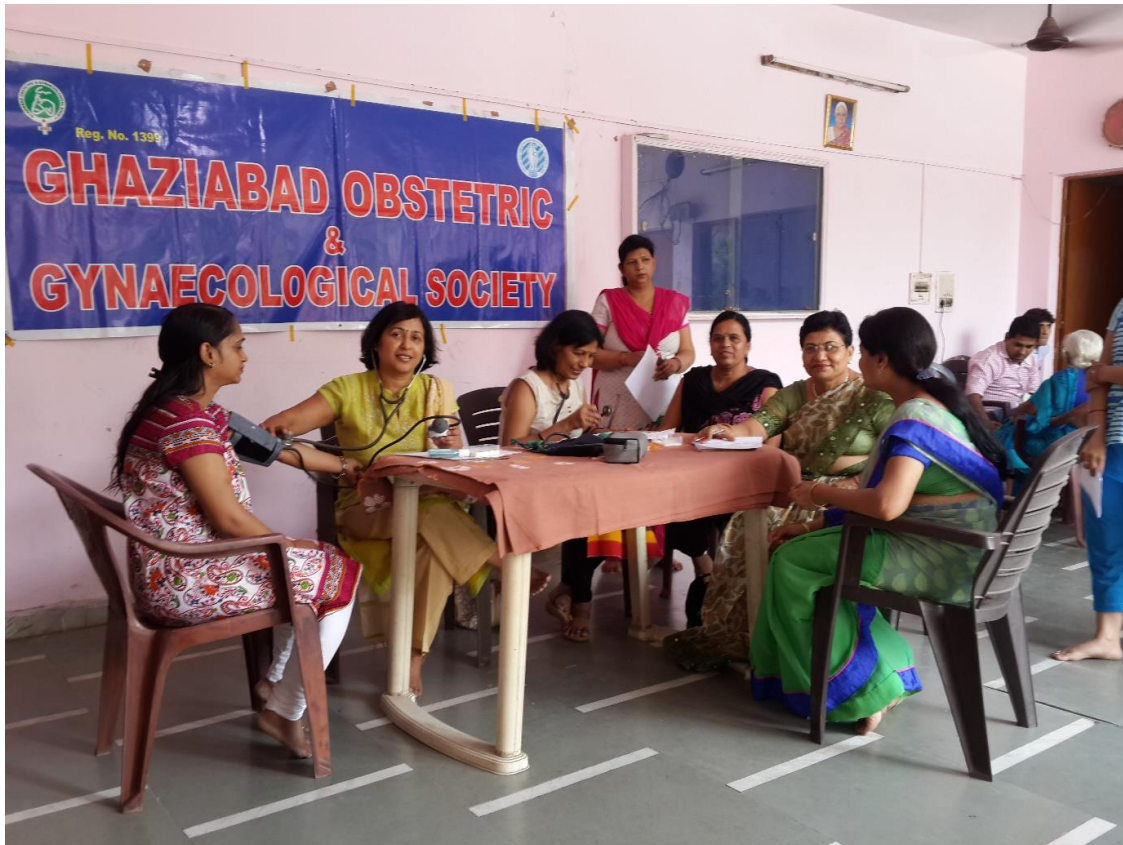
Camp on Mother's Day