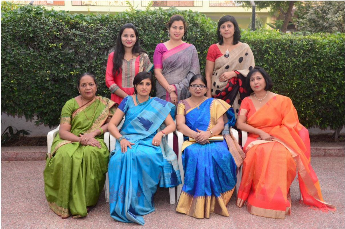
Team GOGS (2016-17)