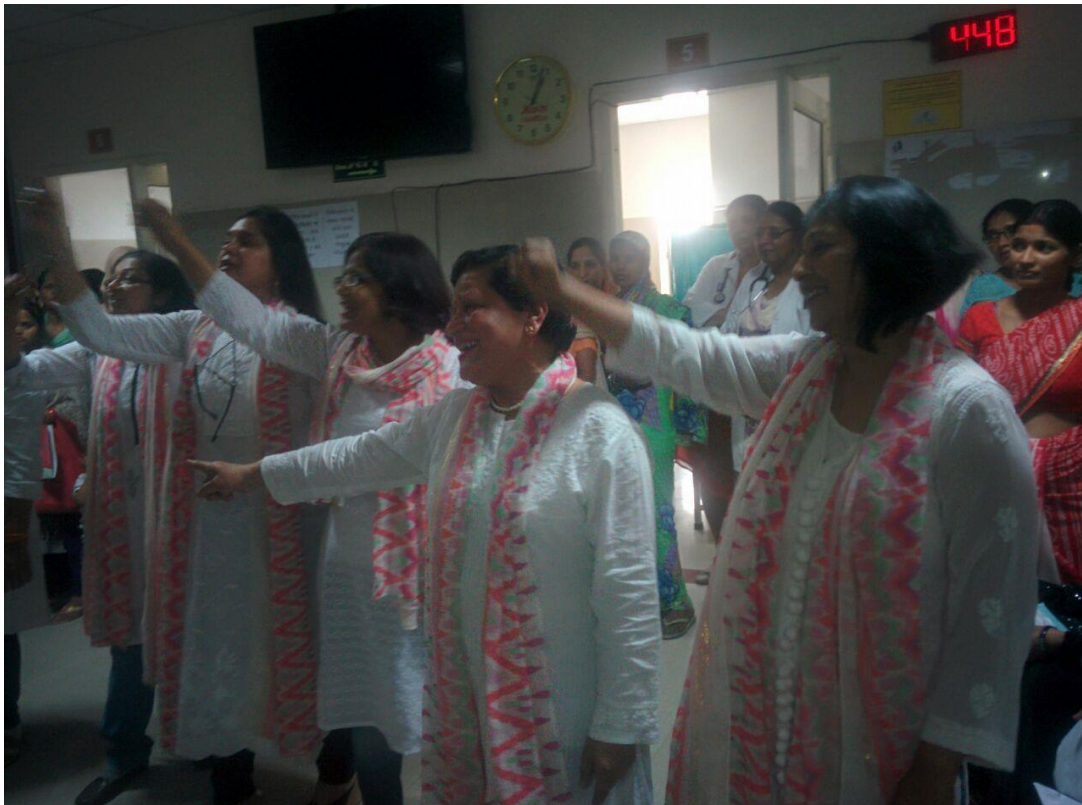
Nukkad Naatak at PAC